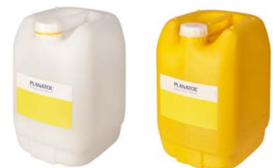
Fold-glues and fold-softening concentrates

Learn more about adhesives and fold-softening concentrates from our brochure „Planatol Fold-Glues“)